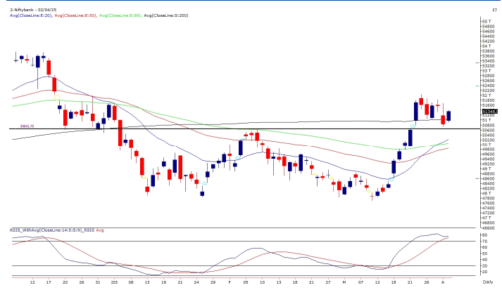
Exhibit 2: Nifty Bank Daily Chart

While the 51800–52000 zone serves as a clear resistance band, immediate resistance may be encountered around 51500–51650 . On the downside, immediate support is placed in the 51100–51000 zone.