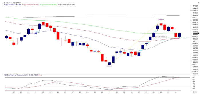
Exhibit 1: Nifty Daily Chart

Conversely, a break below 23100 might trigger weakness, with the next support near 22900 . Given the weekly expiry, traders should closely monitor global cues and the key levels mentioned to formulate their strategies.