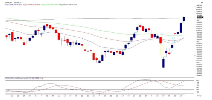
Exhibit 1: Nifty Daily Chart

These gaps will now act as support zones, with yesterday's gap around 23900 serving as the immediate support followed by the 23800 level, which previously acted as resistance and has now turned into strong support. While the overall trend remains bullish and we advise against contrarian bets, given that hourly indicators have now entered the overbought zone, fresh long positions on the index should ideally be initiated on dips for better risk-reward setups.