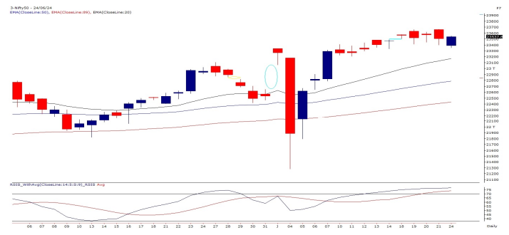
Exhibit 1: Nifty Daily Chart

While key indices struggle for trending action, individual stocks continue to show strong performance. Focus on these opportunities for outperformance. Although there isn't much happening globally, it's essential to keep an eye on global developments, as they might trigger the next set of actions.