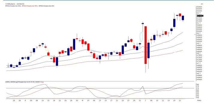
Exhibit 2: Nifty Bank Daily Chart